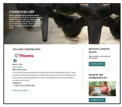
Sample of Exhibitor Listing on website