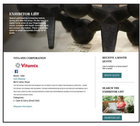
Sample of Exhibitor Listing on website

MARCH 9-11 & 16-18, 2018 | BUFFALO NIAGARA CONVENTION CENTER